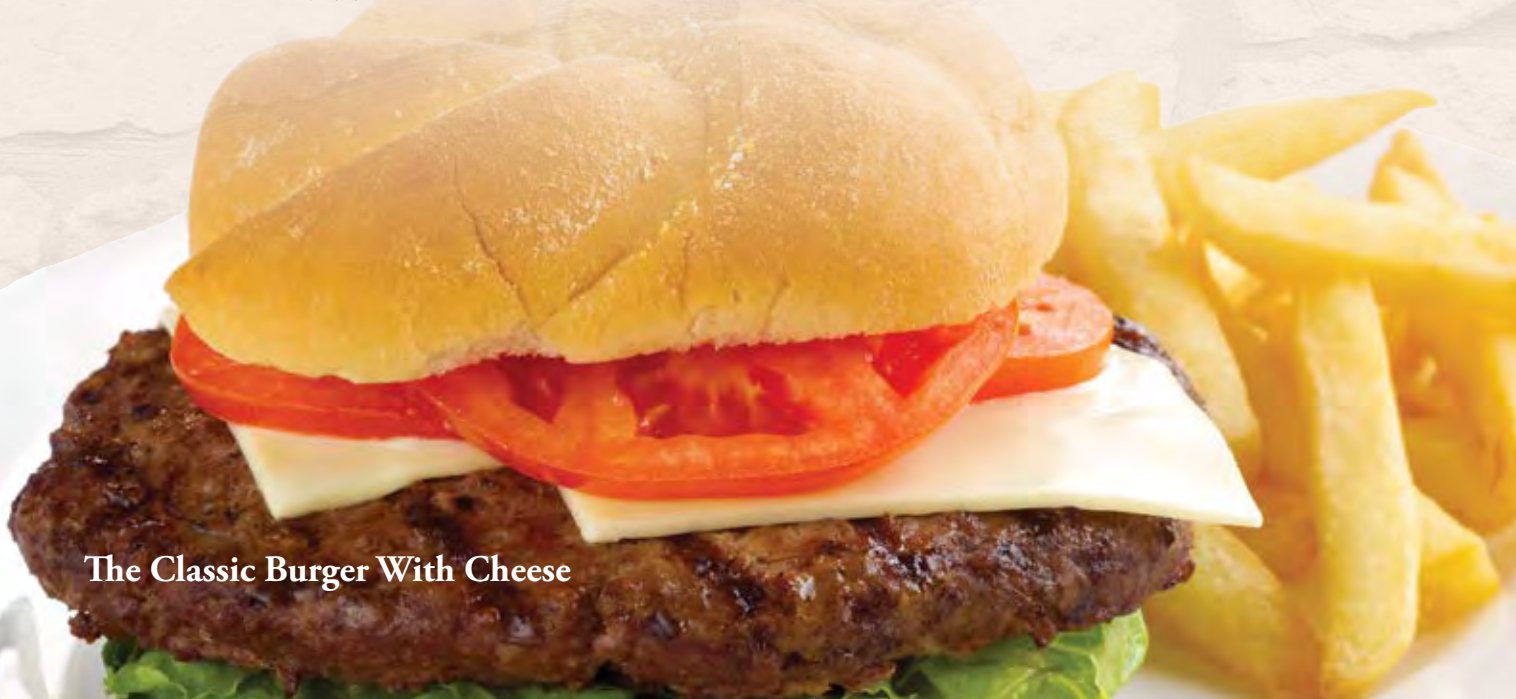
The Classic Burger With Cheese

NOTICE: Consuming raw or undercooked meats, poultry, seafood, shellfish, or eggs, may increase your risk of food borne illness, especially if you have certain medical conditions.